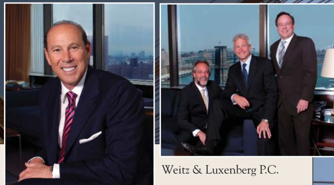
Weitz &amp; Luxenberg P.C.

The nomination pool for the 2007 edition consisted of all lawyers whose names appeared in the previous edition of Best Lawyers , lawyers who were nominated since the previous survey, and new nominees solicited from listed attorneys. In general, lawyers were asked to vote only on nominees in their own specialty in their own jurisdiction. Lawyers in closely related specialties were asked to vote across specialties, as were lawyers in smaller jurisdictions. Where specialties are national or international in nature, lawyers were asked to vote nationally as well as locally. Voting lawyers were also given an opportunity to offer more detailed comments on nominees. Each year, half of the voting pool receives fax or email ballots; the other half is polled by phone.