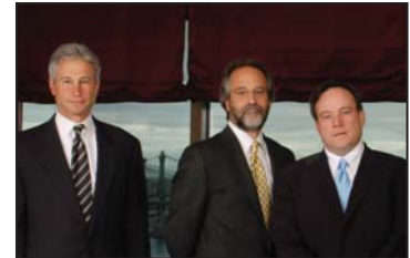
Weitz & Luxenberg P.C.

the case yourself, to whom would you refer them?" All votes and comments were solicited with a guarantee of confidentiality — a critical factor in the viability and validity of Best Lawyers ® surveys. To ensure the rigor of the selection process, lawyers were urged to use only their highest standards when voting, and to evaluate each nominee based only on his or her individual merits. The additional comments were used to make more accurate comparisons between voting patterns and weight votes accordingly. Best Lawyers uses various methodological tools to identify and correct for anomalies in both the nomination and voting process.