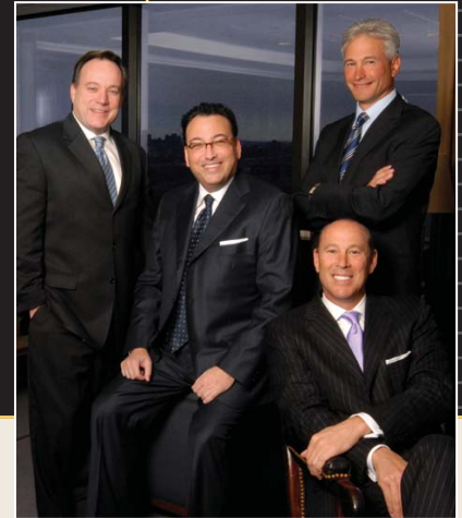
Weitz &amp; Luxenberg